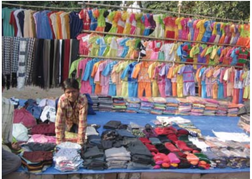
Small traders of readymade garments facing stiff competition from both MNC brands and imports.

In general, with the opening of trade, goods travel from one market to another. Choice of goods in the markets rises. Prices of similar goods in the two markets tend to become equal. And, producers in the two countries now closely compete against each other even though they are separated by thousands of miles! Foreign trade thus results in connecting the markets or integration of markets in different countries.