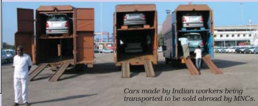
Cars made by Indian workers being transported to be sold abroad by MNCs.