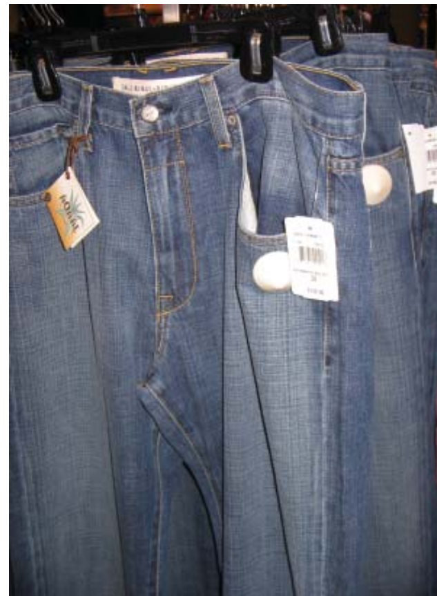
Jeans produced in developing countries being sold in USA for Rs 6500 ($145)

The products are supplied to the MNCs, which then sell these under their own brand names to the customers. These large MNCs have tremendous power to determine price, quality, delivery, and labour conditions for these distant producers.