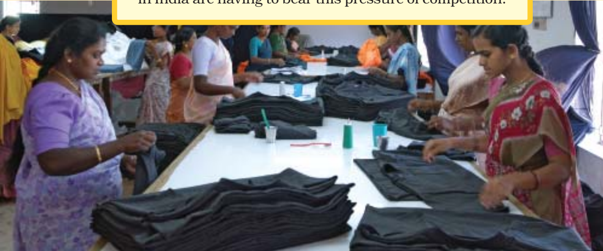
Factory workers folding garments for export. Though globalisation has created opportunities for paid work for women, the condition of employment shows that women are denied their fair share of benefits.

Let us see how the workers in the garment export industry in India are having to bear this pressure of competition.