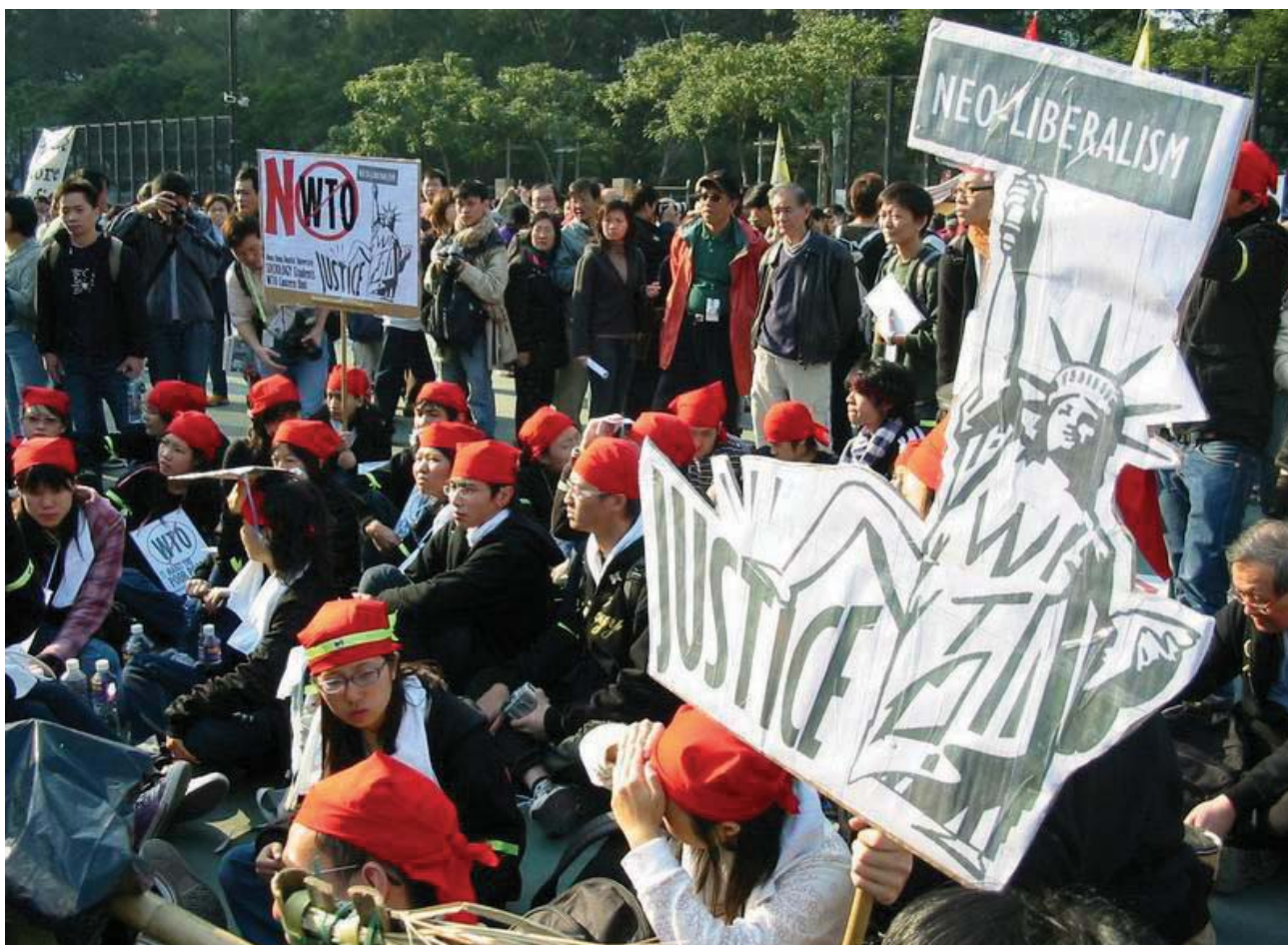
A demonstration against WTO in Hong Kong, 2005