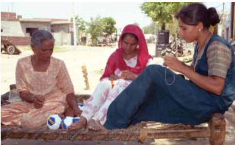
Women at home in Ludhiana making footballs for large MNCs

There's another way in which MNCs control production. Large MNCs in developed countries place orders for production with small producers. Garments, footwear, sports items are examples of industries where production is carried out by a large number of small producers around the world.