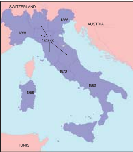
Fig. 14(b) – Italy after unification. The map shows the year in which different regions (seen in Fig 14(a)) become part of a unified Italy.