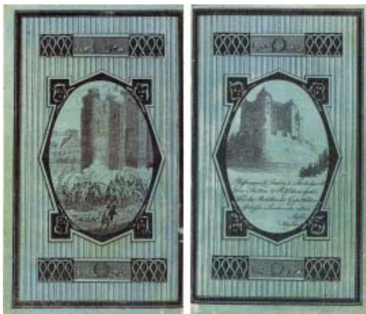
Fig. 2 – The cover of a German almanac designed by the journalist Andreas Rebmann in 1798.

When the news of the events in France reached the different cities of Europe, students and other members of educated middle classes began setting up Jacobin clubs. Their activities and campaigns prepared the way for the French armies which moved into Holland, Belgium, Switzerland and much of Italy in the 1790s. With the outbreak of the revolutionary wars, the French armies began to carry the idea of nationalism abroad.