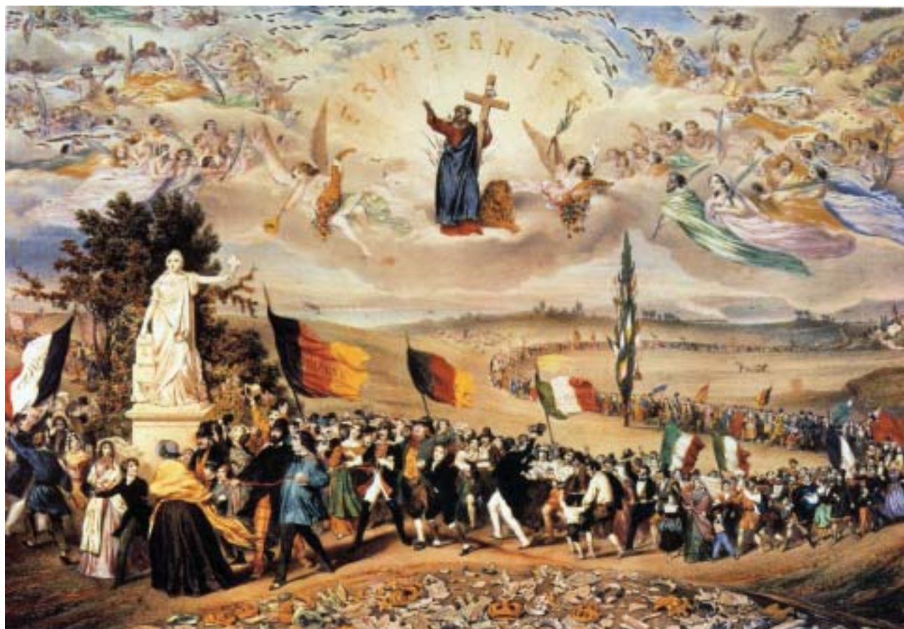
Fig. 1 – The Dream of Worldwide Democratic and Social Republics – The Pact Between Nations, a print prepared by Frédéric Sorrieu, 1848.

In 1848, Frédéric Sorrieu, a French artist, prepared a series of four prints visualising his dream of a world made up of ‘democratic and social Republics’, as he called them. The first print (Fig. 1) of the series, shows the peoples of Europe and America – men and women of all ages and social classes – marching in a long train, and offering homage to the statue of Liberty as they pass by it. As you would recall, artists of the time of the French Revolution personified Liberty as a female figure – here you can recognise the torch of Enlightenment she bears in one hand and the Charter of the Rights of Man in the other. On the earth in the foreground of the image lie the shattered remains of the symbols of absolutist institutions. In Sorrieu’s utopian vision, the peoples of the world are grouped as distinct nations, identified through their flags and national costume. Leading the procession, way past the statue of Liberty, are the United States and Switzerland, which by this time were already nation-states. France,