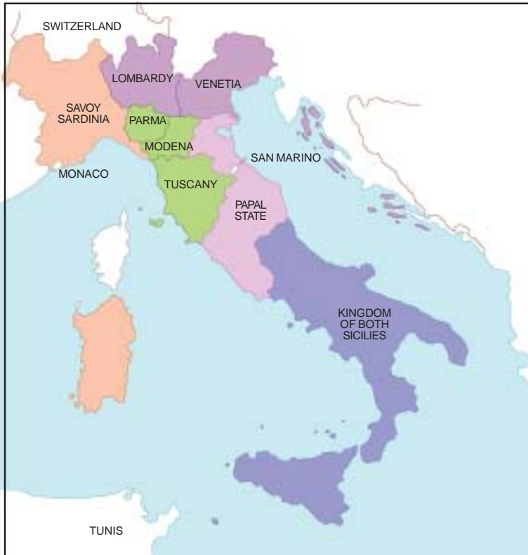
Fig. 14(a) – Italian states before unification, 1858.

Look at Fig. 14(a). Do you think that the people living in any of these regions thought of themselves as Italians? Examine Fig. 14(b). Which was the first region to become a part of unified Italy? Which was the last region to join? In which year did the largest number of states join?