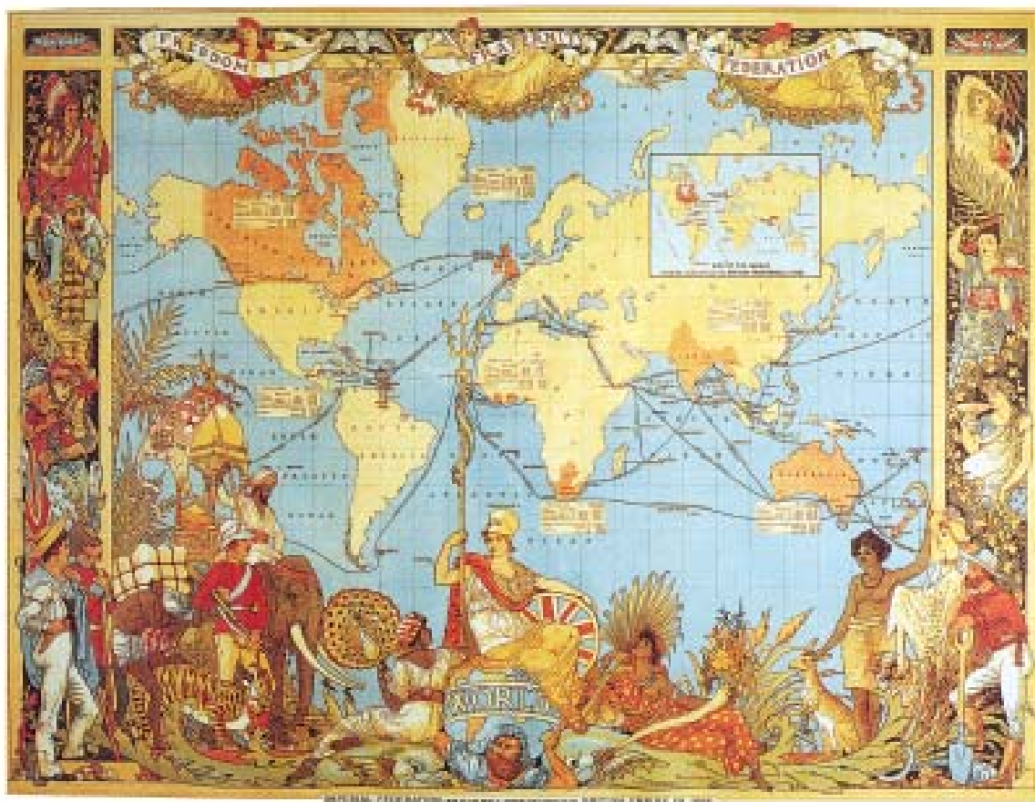
Fig. 20 – A map celebrating the British Empire.

At the top, angels are shown carrying the banner of freedom. In the foreground, Britannia – the symbol of the British nation – is triumphantly sitting over the globe. The colonies are represented through images of tigers, elephants, forests and primitive people. The domination of the world is shown as the basis of Britain's national pride.