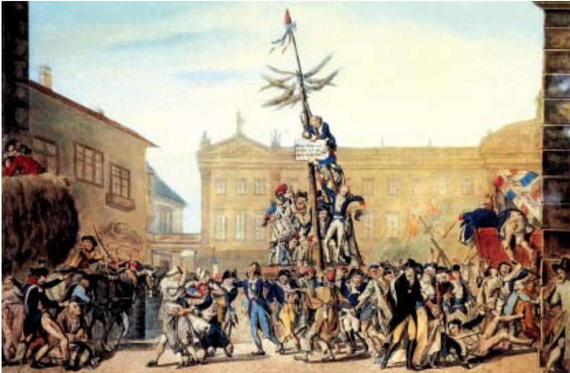
Fig. 4 – The Planting of Tree of Liberty in Zweibrücken, Germany. The subject of this colour print by the German painter Karl Kaspar Fritz is the occupation of the town of Zweibrücken by the French armies. French soldiers, recognisable by their blue, white and red uniforms, have been portrayed as oppressors as they seize a peasant's cart (left), harass some young women (centre foreground) and force a peasant down to his knees. The plaque being affixed to the Tree of Liberty carries a German inscription which in translation reads: 'Take freedom and equality from us, the model of humanity.' This is a sarcastic reference to the claim of the French as being liberators who opposed monarchy in the territories they entered.

enjoyed a new-found freedom. Businessmen and small-scale producers of goods, in particular, began to realise that uniform laws, standardised weights and measures, and a common national currency would facilitate the movement and exchange of goods and capital from one region to another.