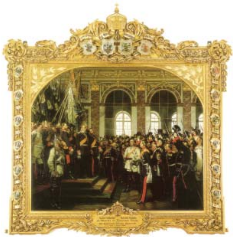
Fig. 11 – The proclamation of the German empire in the Hall of Mirrors at Versailles, Anton von Werner. At the centre stands the Kaiser and the chief commander of the Prussian army, General von Roon. Near them is Bismarck. This monumental work (2.7m x 2.7m) was completed and presented by the artist to Bismarck on the latter's 70th birthday in 1885.

The nation-building process in Germany had demonstrated the dominance of Prussian state power. The new state placed a strong emphasis on modernising the currency, banking, legal and judicial systems in Germany. Prussian measures and practices often became a model for the rest of Germany.