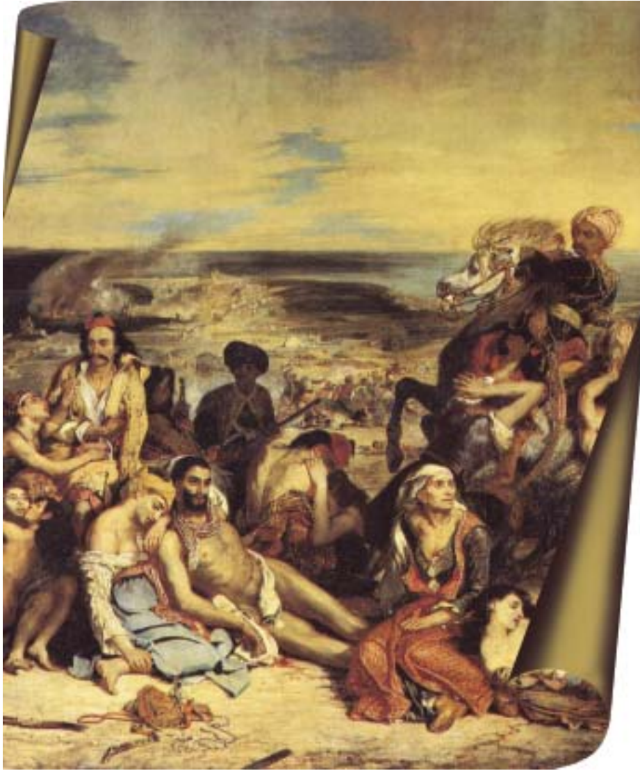
Fig. 8 — The Massacre at Chios, Eugene Delacroix, 1824.

The French painter Delacroix was one of the most important French Romantic painters. This huge painting (4.19m x 3.54m) depicts an incident in which 20,000 Greeks were said to have been killed by Turks on the island of Chios. By dramatising the incident, focusing on the suffering of women and children, and using vivid colours, Delacroix sought to appeal to the emotions of the spectators, and create sympathy for the Greeks.